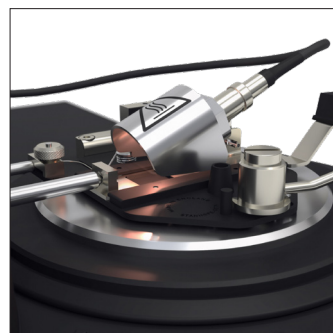
Automatic dip of ignition source and flash detection