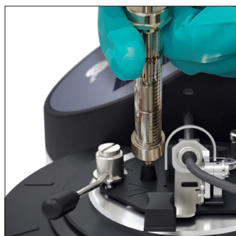
Inject 2 mL sample