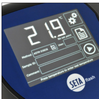
Select test temperature